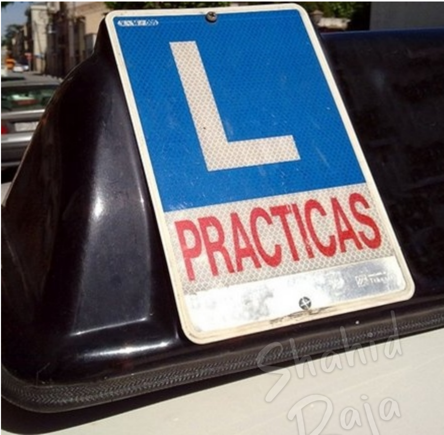
New qualified driver